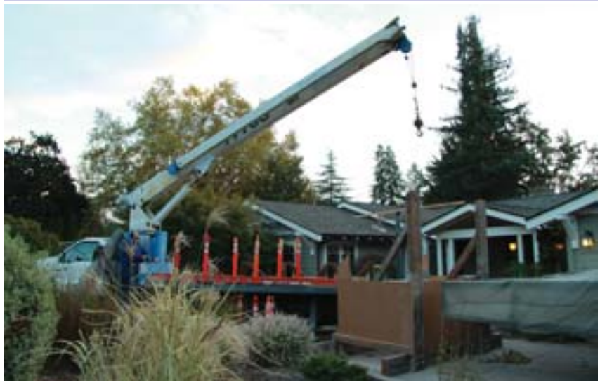
It helps to have a 70 foot crane for pre-launch

Watch Death Star and Millennium Falcon construction videos online at: https://www.youtube.com/watch?v=OT0RH4EAnLY&feature=youtu.be https://www.youtube.com/watch?v=fHzesa5 ltY&feature=youtu.be