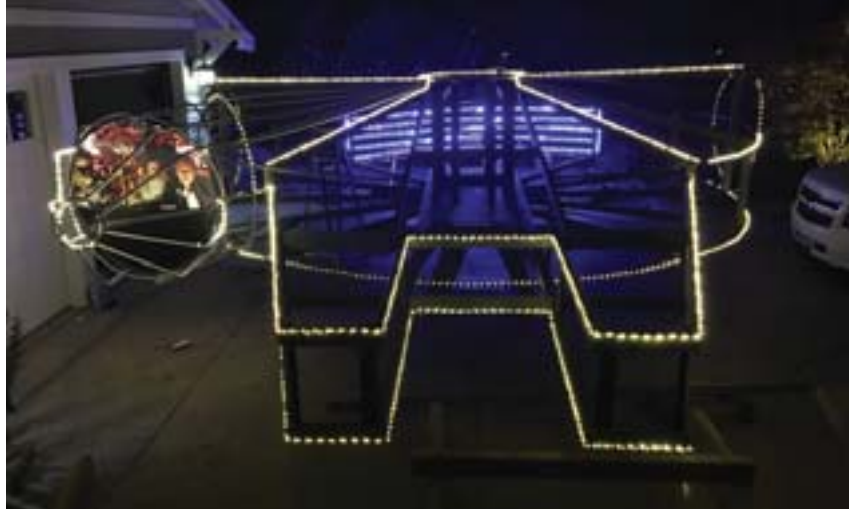
Running lights on and primed for liftoff!